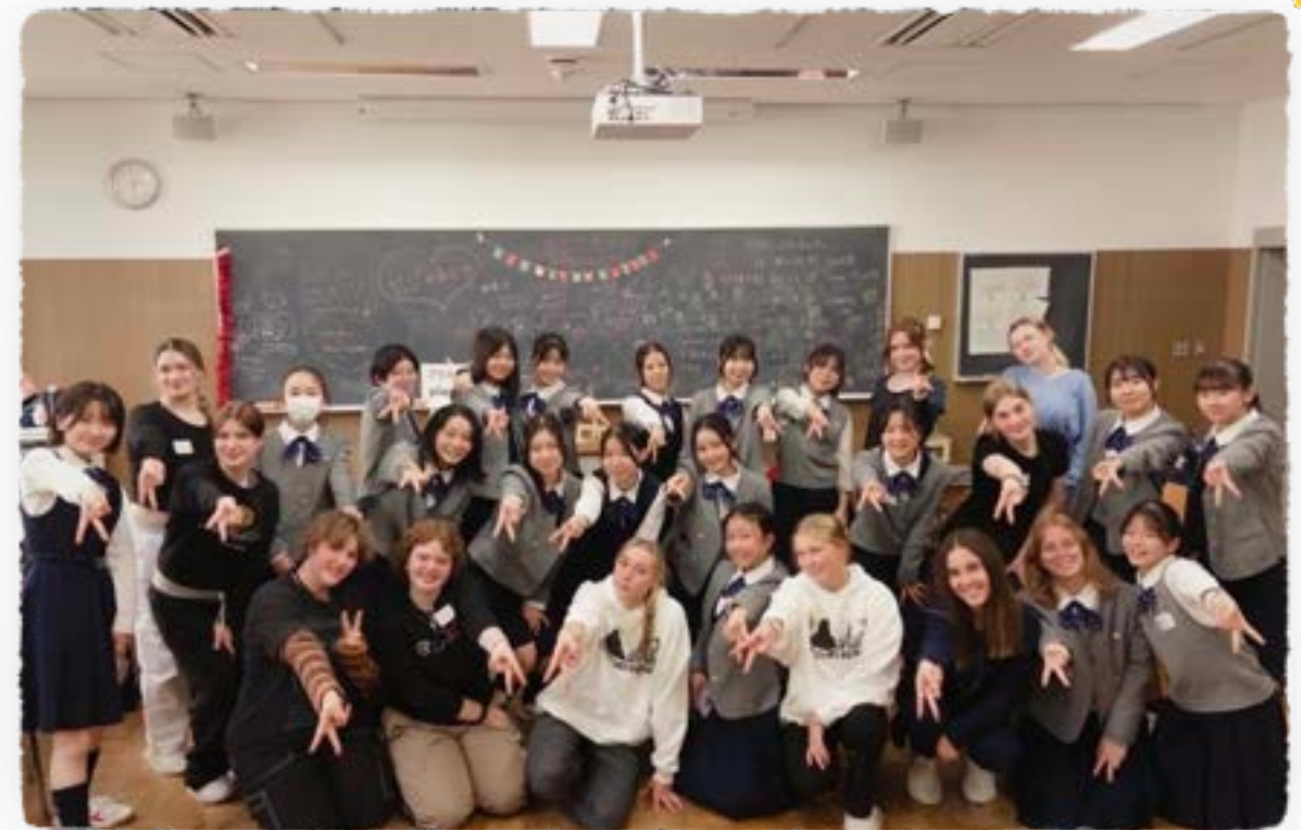
(Farewell Party with St.Rita's College held by ACE)