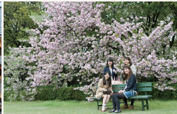
Niiza campus surrounded by nature and equipped with excellent facilities that offer a place of relaxed leaning.