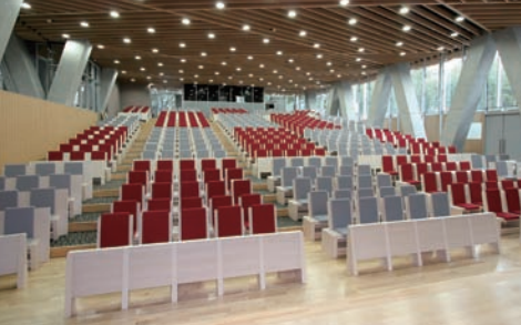
Bunkyo campus, located in the heart of the city, enables students to come into frequent contact with the latest information and various cultures.